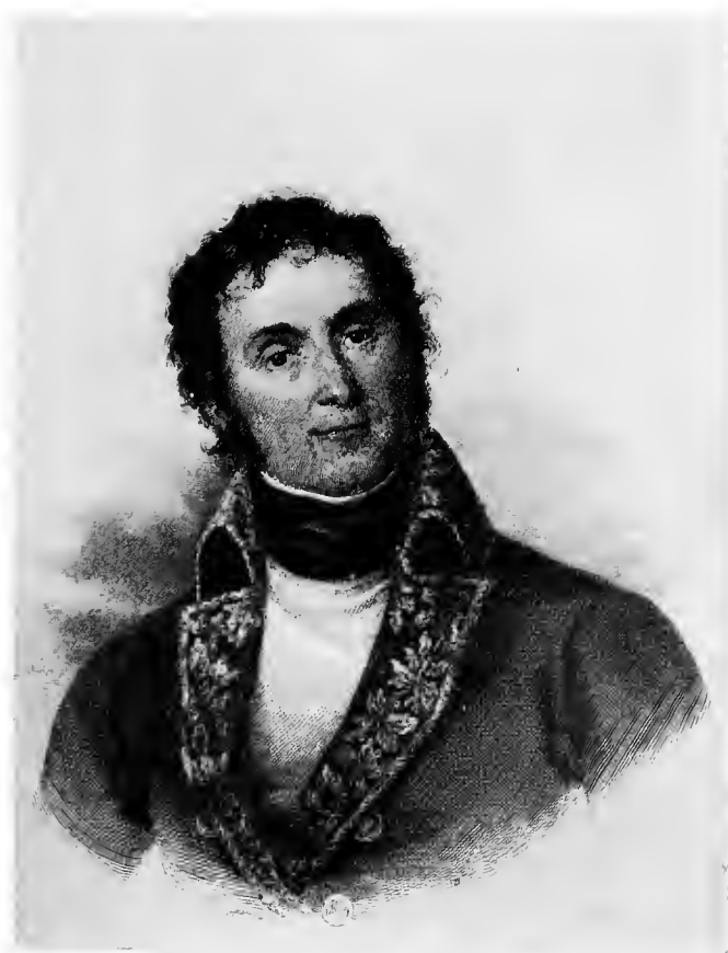
ANDRÉ MASSENA, PRINCE OF ESSLING